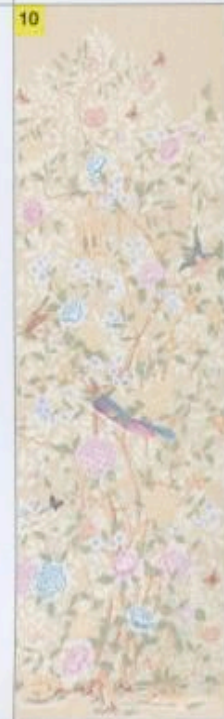
06 Last year we saw leather look tiles, but Spain's Saloni Ceramica took it one step further with its launch of the Laca Range - a ceramic tile overlaid with real leather, with a mock-croc look. The 6 x 45cm piece is entitled Laca Chic. www.saloni.com 07 The Peace Hotel collection was Falper's new bathroom furniture launch, designed by Paolo Navone. Inspired by Shanghai in the 1950s, the Coco cabinet is made of ebony, with door fronts in idropan - a type of ecologically sound waterproof chipboard. This is then lacquered in a glossy white, light blue or jade green finish. www.falper.it 08 The award winning Refin Ceramiche stand was a riot of colour, provided by the new wall tile collection, entitled R-evolution, designed by Karim Rashid for Designstalestudio, Refin's creative laboratory. The lively and bright patterns were typically Rashid and inspired by digital communication. www.refin.it 09 Amarcard is a double washbasin from Eurolegno , shown in the bathroom section of the fair. 180 x 50 x 54cm, the luxurious looking unit is gloss painted with crystal washbasins and chrome handles. Eurolegno products are available in Harrods. www.eurolegno.it 10 Novoceram presented the Florilège collection that had everyone fooled into thinking it was wallpaper. Inspired by ancient Chinese paper walls, the 22.5 x 45cm wall tiles form an almost seamless panel that, until closer inspection, appears to be embroidered. www.novoceram.fr

rassegna stampa - ghenos srl 4, via Poliziano 20154 Milano